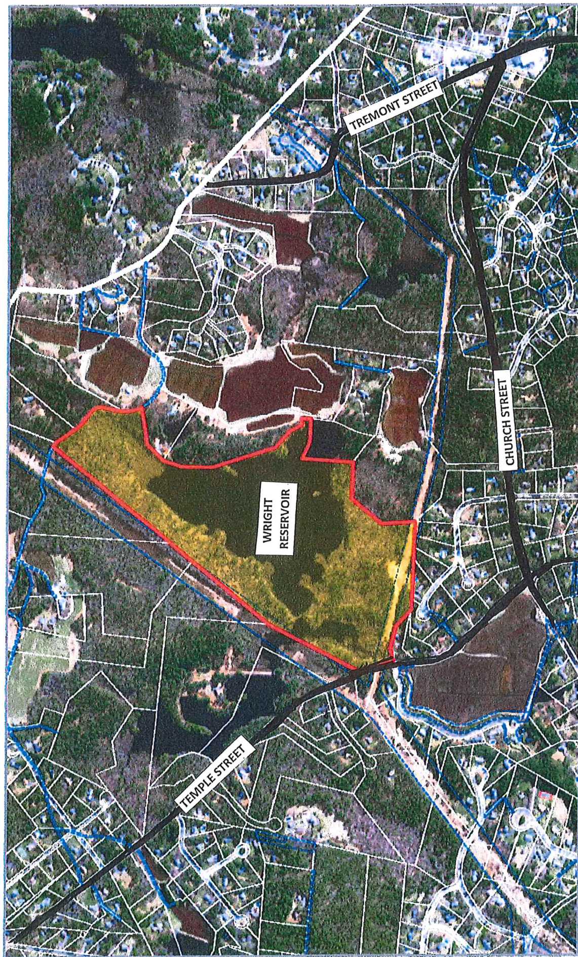
ATTACHMENT B: AREA WHERE HUNTING IS ALLOWED