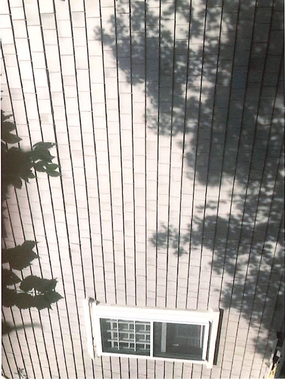
West Side - 57 Shipyard Ln.