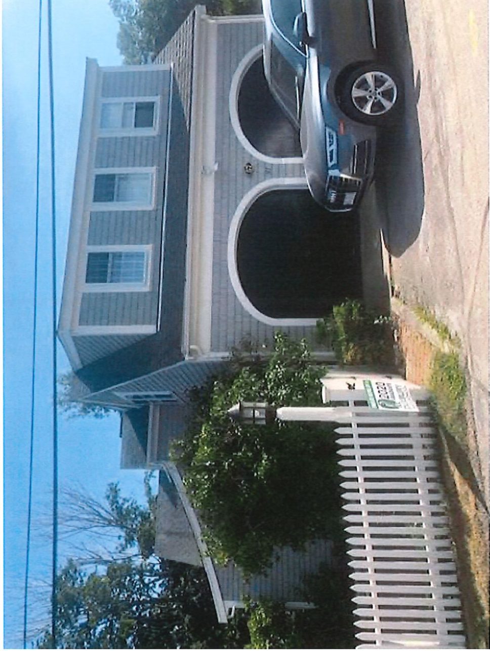
North Side - 57 Shipyard Ln.