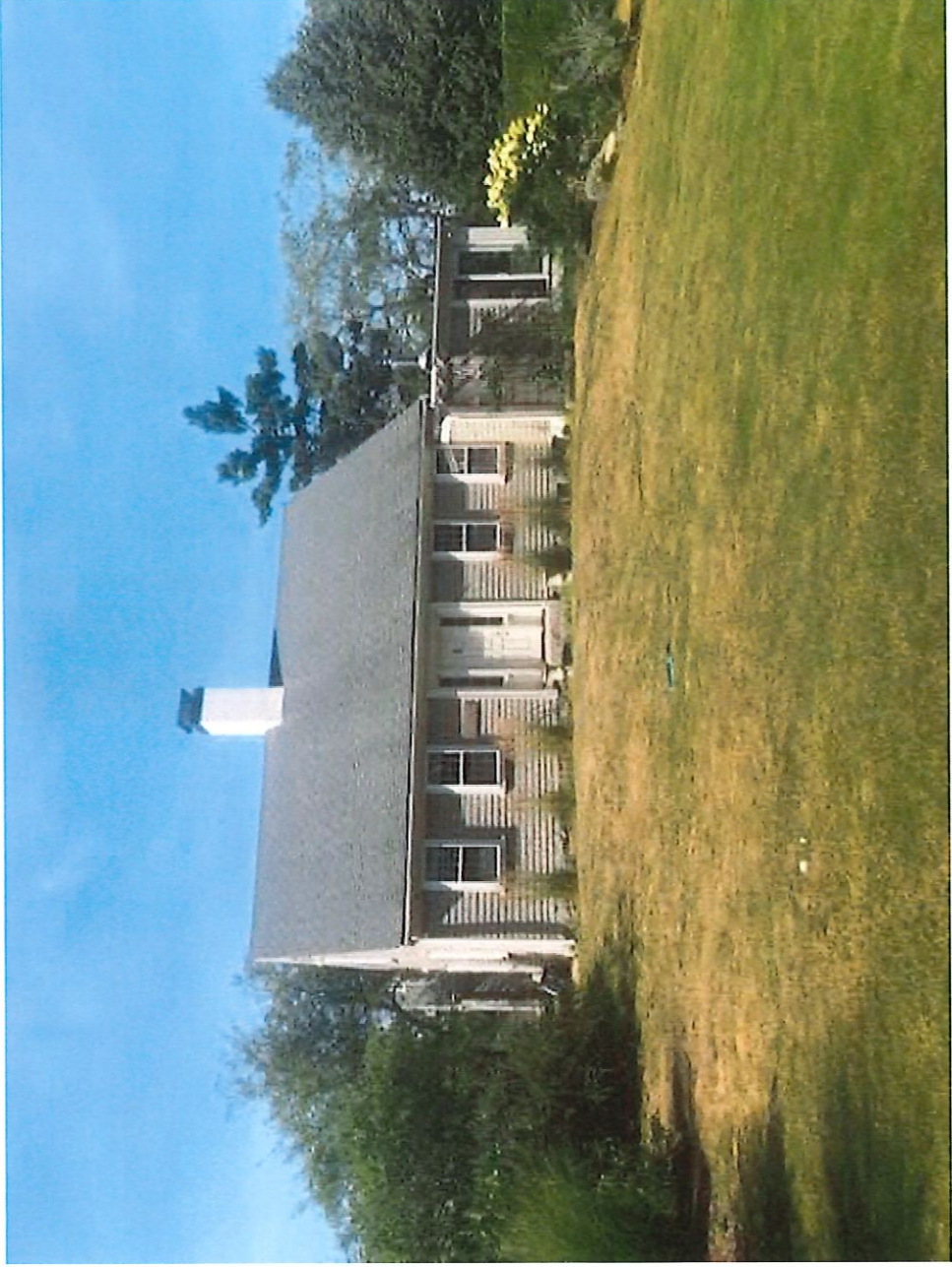
South Side - 577 Shipyard Ln.