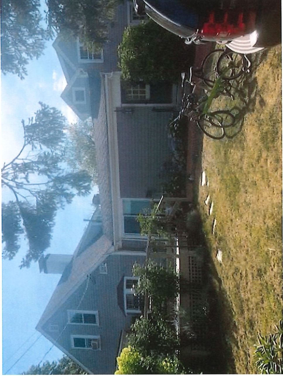
East Side - 57 Shipyard Ln.