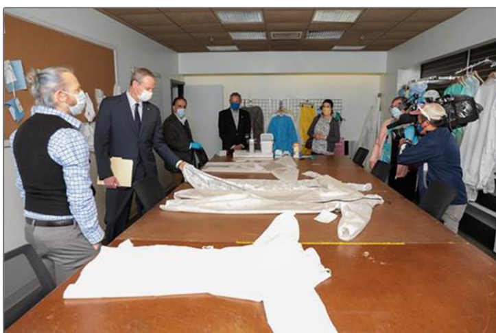
Governor Baker examines some of the personal protective equipment made by Merrow Manufacturing of Fall River during his visit to the facility.