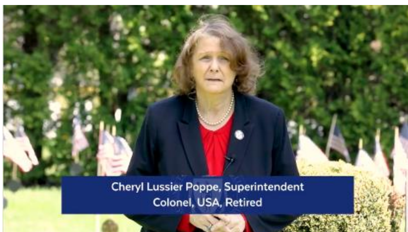
Several Days of Virtual Memorial Day Observances Kicked-Off Today with Live Streamed Ceremonies at The Chelsea Soldiers' Home. See below details below.