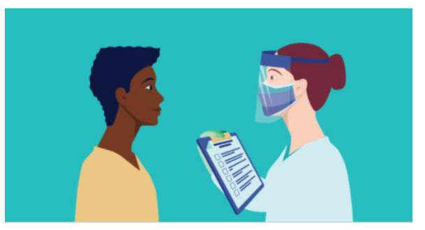
COVID-19 Testing Testing for Coronavirus Disease 2019 (COVID-19) is widely available in Massachusetts. & mass.gov

Tests must be scheduled in advance and will be performed using a self-swabbing method in a drive-through format. Walk-up testing is not available. Residents arriving for a scheduled test must remain in their car at all times during the testing process. Specimens will be processed by the Broad Institute.