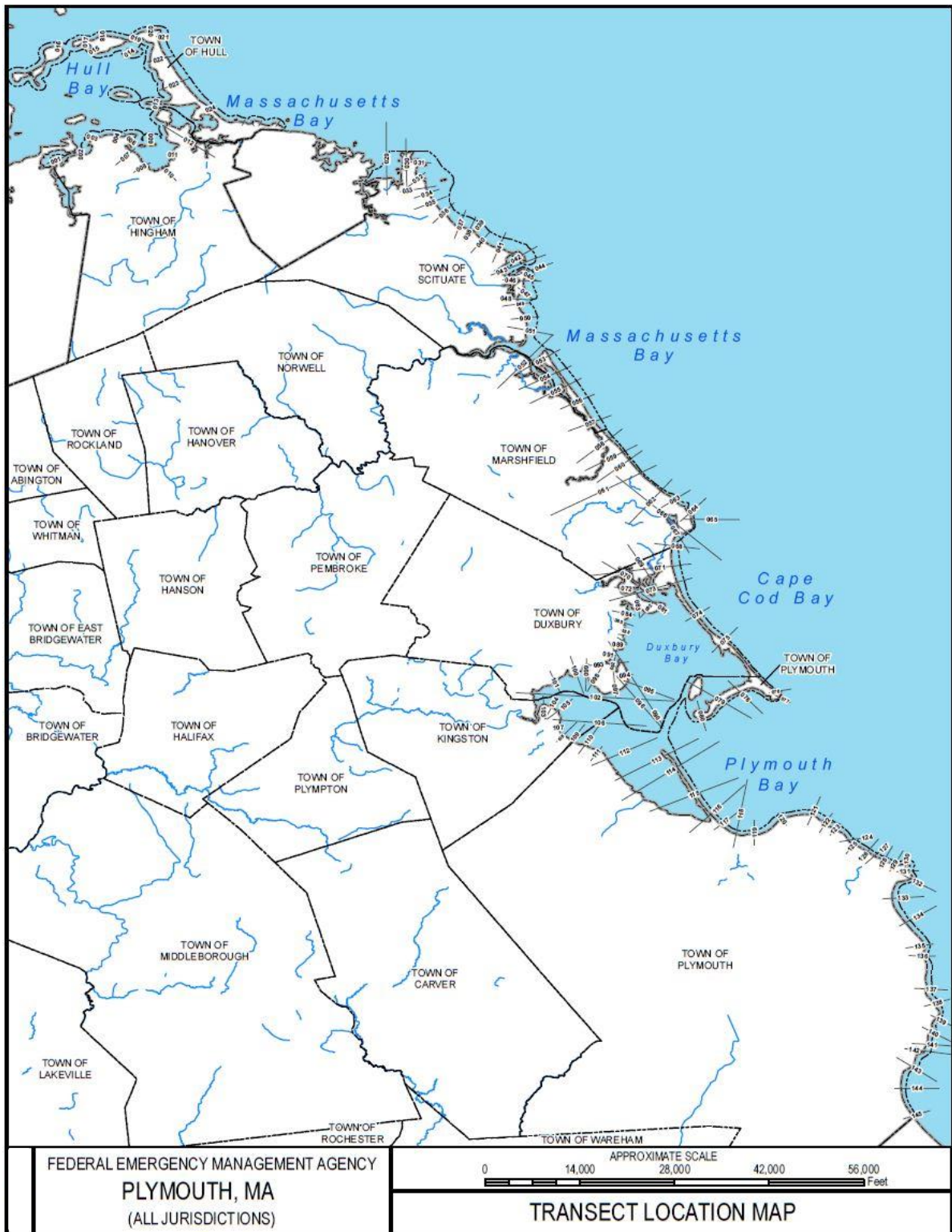
Figure 9: Transect Location Map