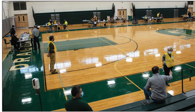
The Duxbury High School gym was transformed into a vaccine clinic with attention to social distancing. Pre-scheduled appointments were necessary for the 480 first responders from Carver, Duxbury, Hanover, Kingston, Marshfield, Pembroke and Plympton.