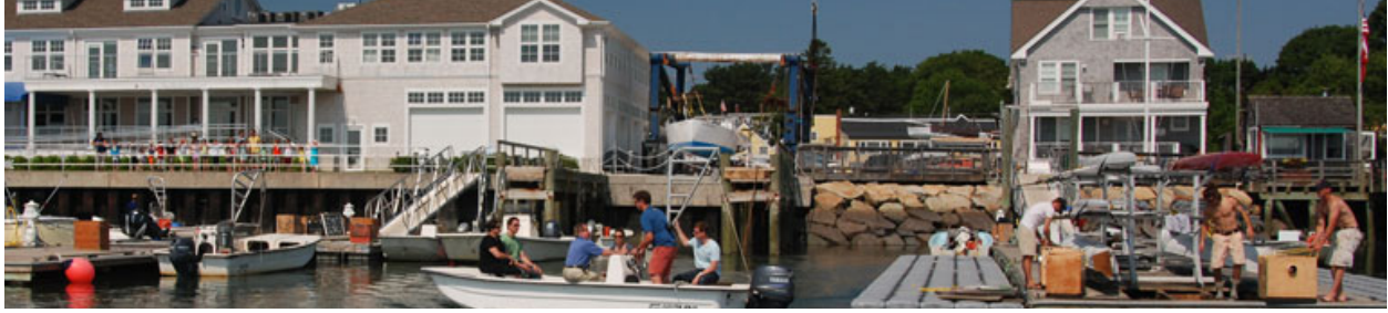
Image: Duxbury Bay