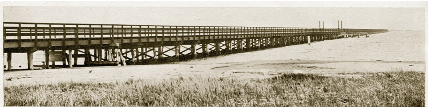
POWDER POINT BRIDGE, DUXBURY