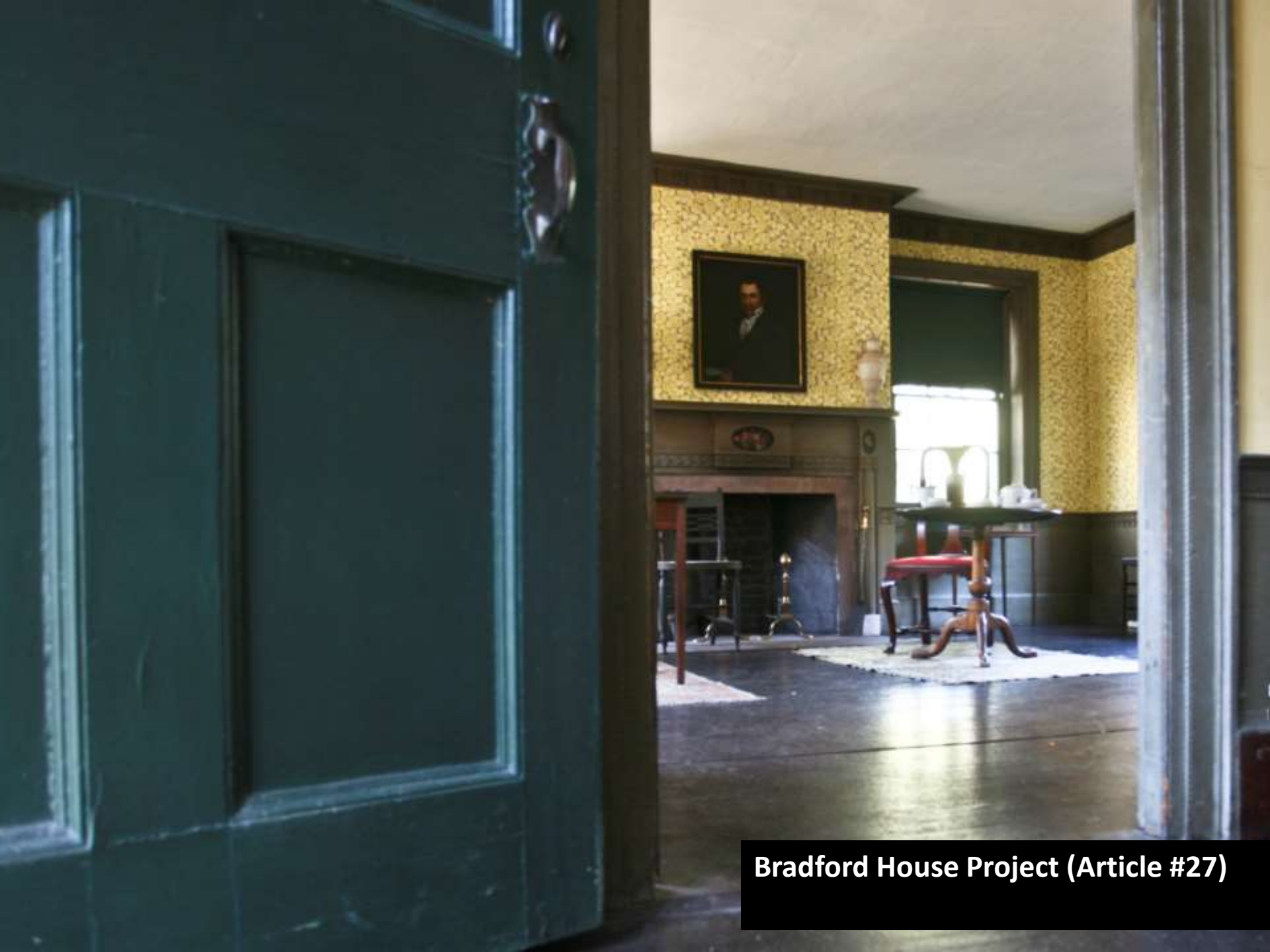
Bradford House Project (Article #27)