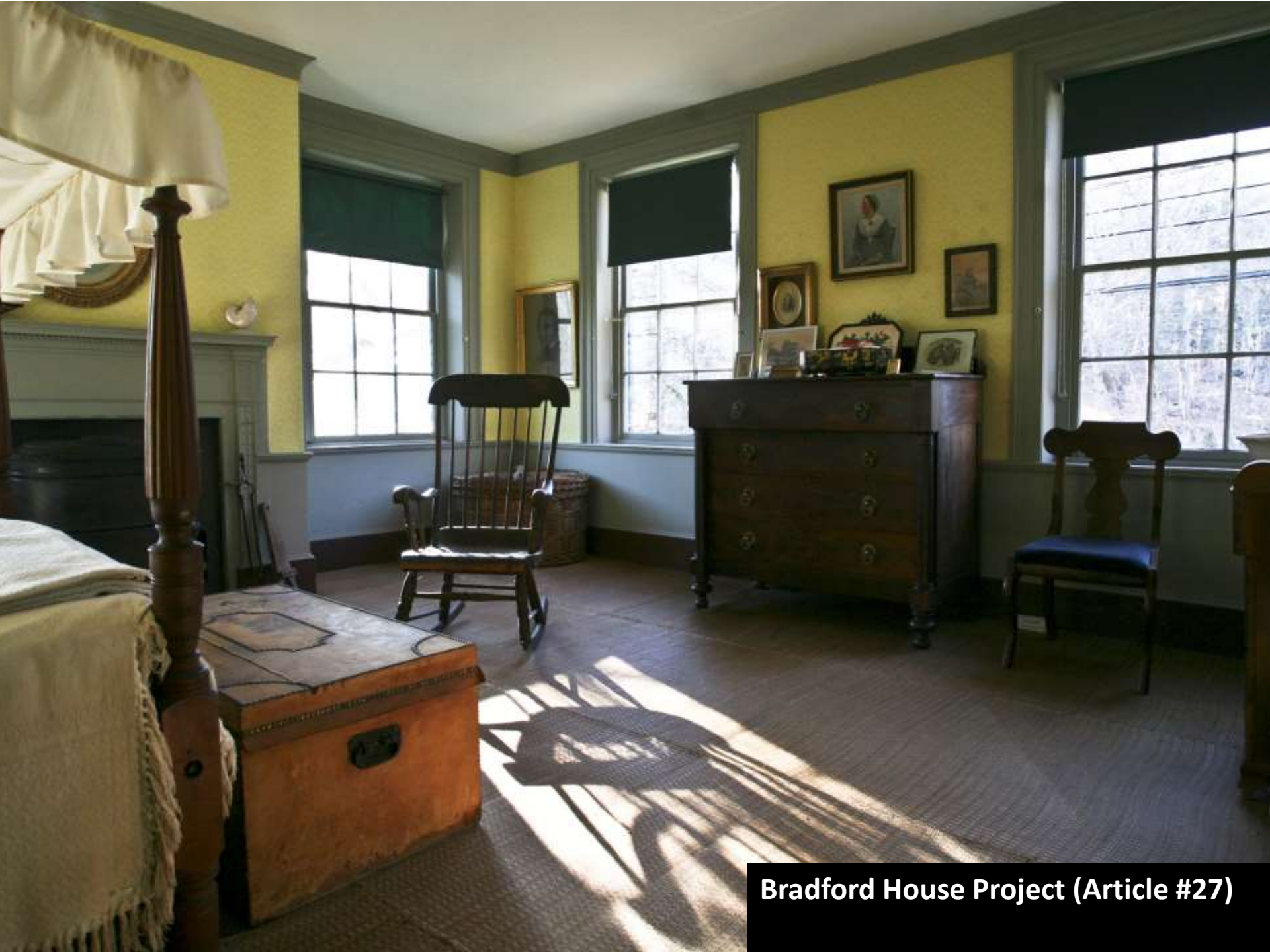
Bradford House Project (Article #27)